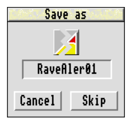
Figure 2 : Save as window

Pressing Split will open the 'save as' window, shown in figure 2 below, (if all the parameters have been set correctly) prompting you to drag the icon to a directory window. If the Single Task option has not been selected from the iconbar menu, then a transfer window will be displayed and the splitting process will begin (see section 2.4, 'The transfer window' on page 4). If you only want to save certain parts, then use the Skip button to miss out the current part.