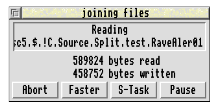
Figure 4 : Transfer window

The transfer window is displayed when splitting or joining has started and multi-tasking is enabled. Figure 4 shows an example of the transfer window.